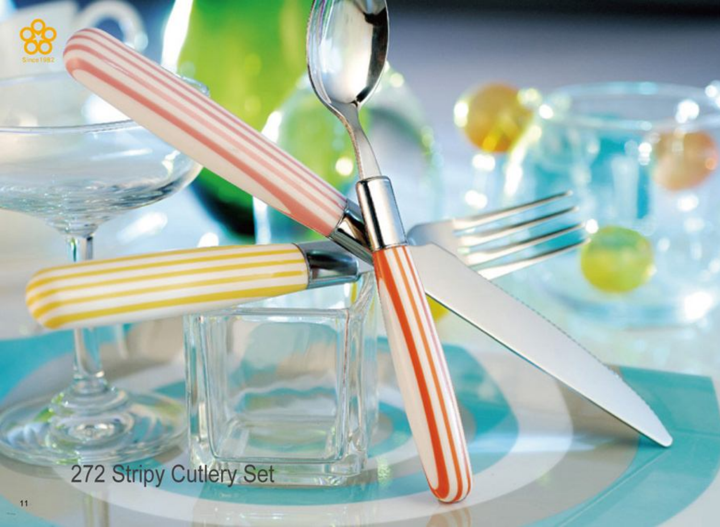
272 Stripy Cutlery Set