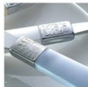
Stainless Steel Sleeve