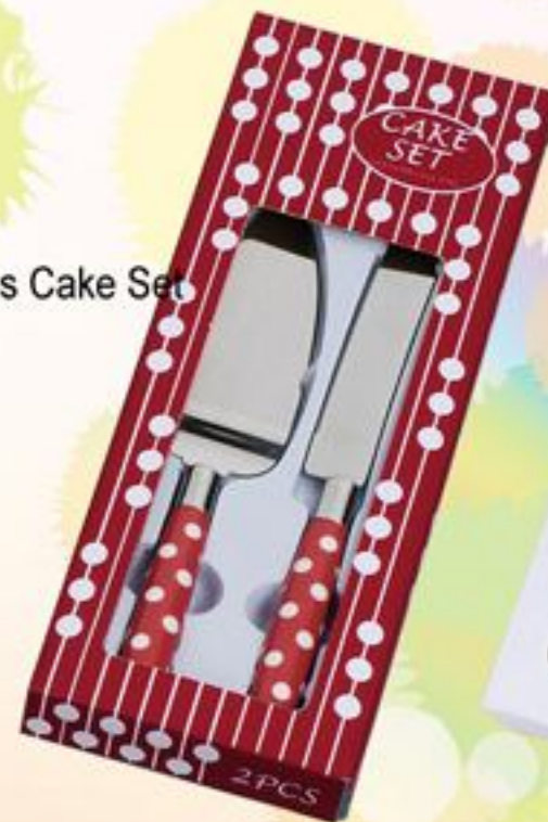
2Pcs Cake Set