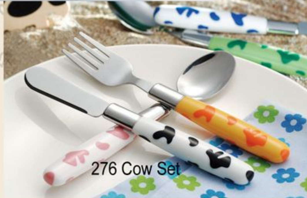
276 Cow Set

STAINLESS STEEL / Safe Plastic Handle Color / Printing OEM Design