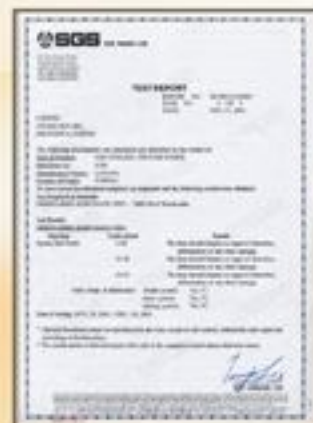
SGS Dishwasher Safe