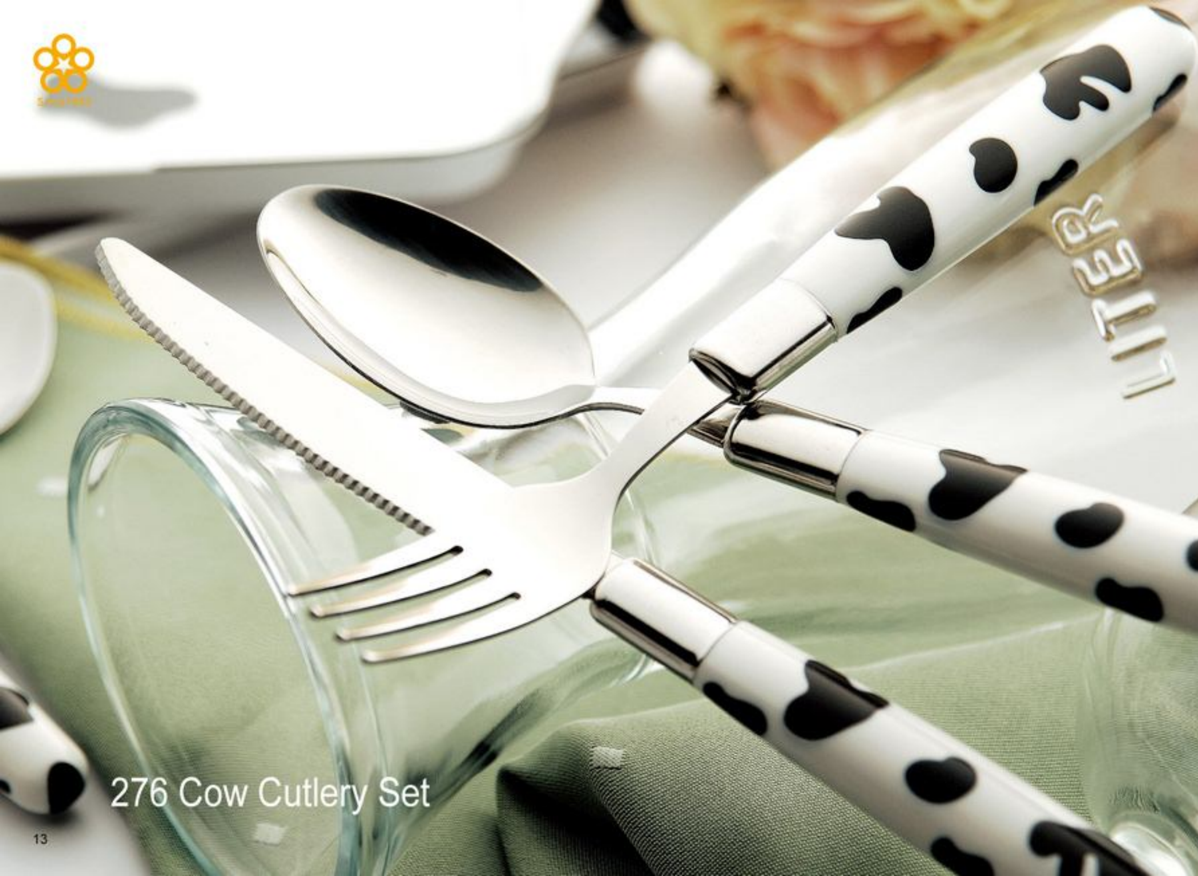
276 Cow Cutlery Set