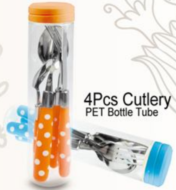
4Pcs Cutlery Set PET Bottle Tube