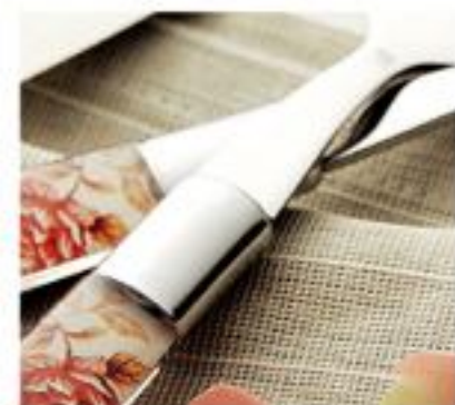
STAINLESS STEEL SLEEVE