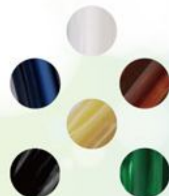
Multi-Colors for OEM