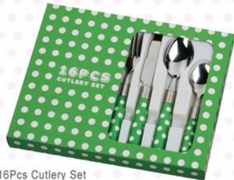
16Pcs Cutlery Set Window Box