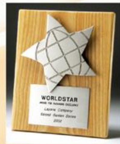
WORLDSTAR AWARD FOR PACKAGING EXCELLENCE SECRET GARDEN SERIES 2002

Tensile Strength of the Cutlery : LAYANA : 117.26 kgf Competitors : 8 kgf