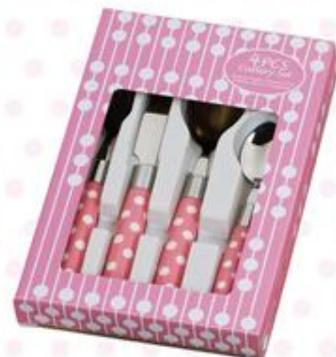
4Pcs Cutlery Set Window Box

Multi-Colors for OEM (More than 80 Colors)