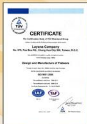
ISO 9001 Qualifide by TUV.

We pride ourselves on offering customers not only competitive prices but also superb products. Our slogan is "Exceed Customer Expectations". Feel free to browse our website, and contact with our dependable staff if you have any question or comment