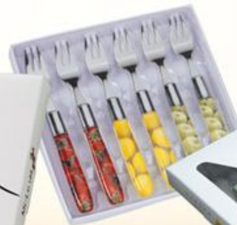
6Pcs Mini Set