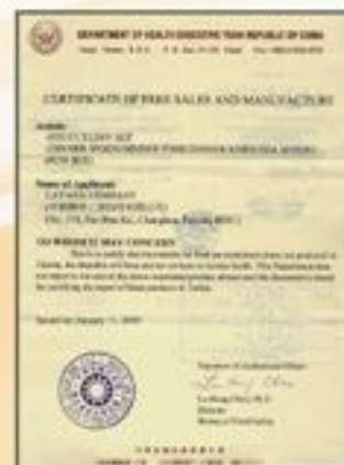
Department of Health Executive.