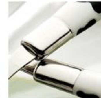
STAINLESS STEEL SLEEVE