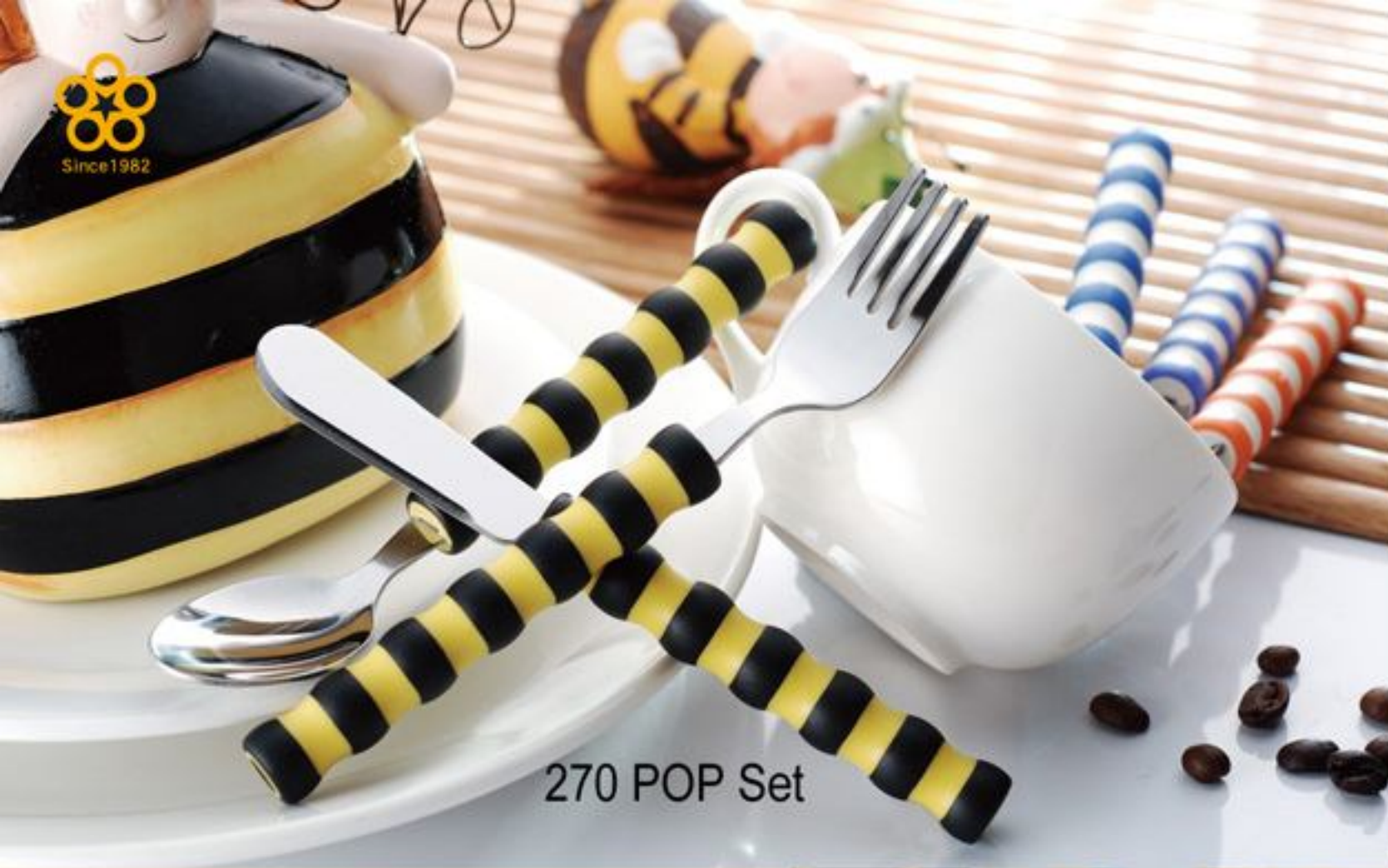
270 POP Set