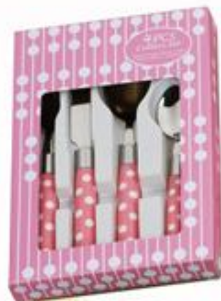
4Pcs Cutlery Set