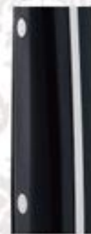
Stainless Steel Rivet