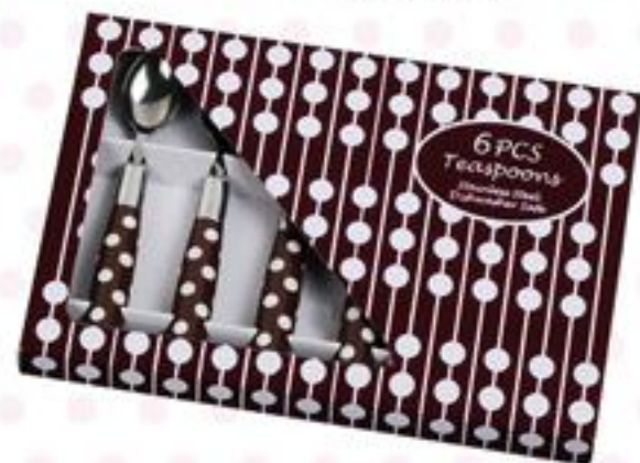
6Pcs Mini Set Window Box