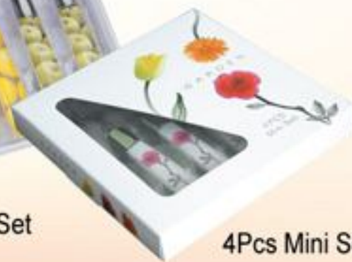
4Pcs Mini Set