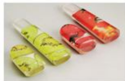
Picture Injection Multi-Designs for OEM