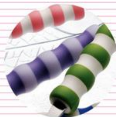
PP Safe Plastic