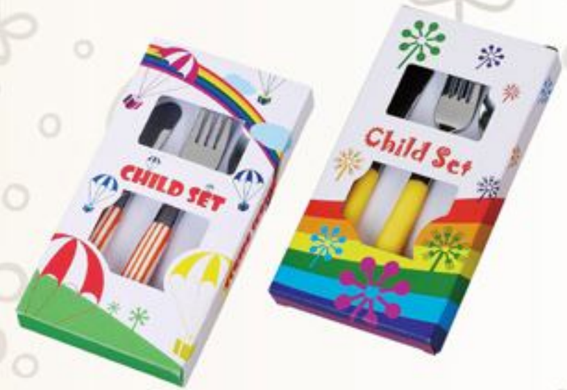
3Pcs Cutlery Set Window Box