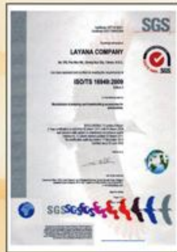
ISO 9001 Qualifide by SGS