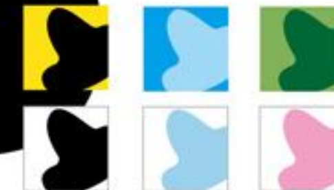
Multi-Colors for OEM