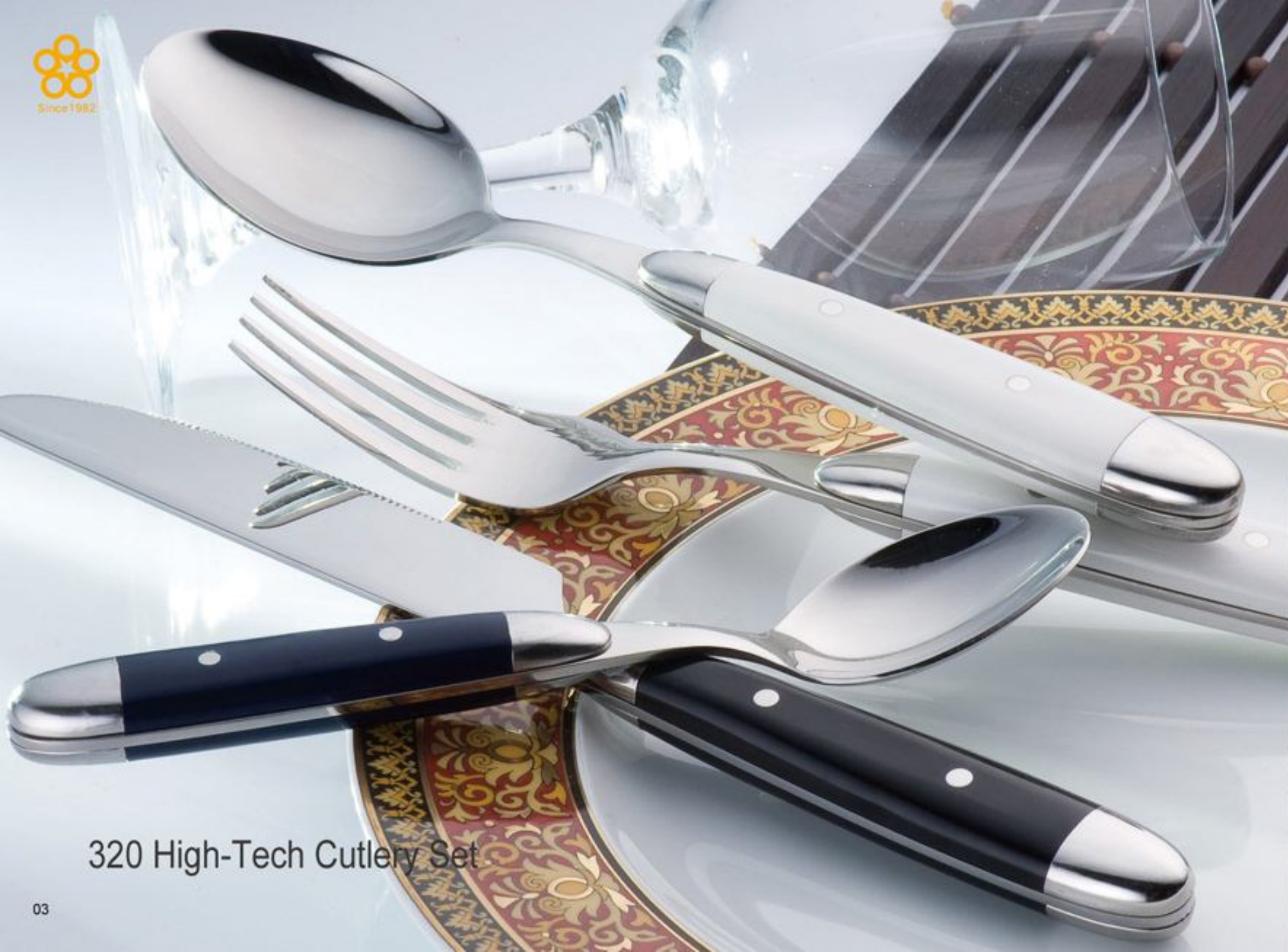
320 High-Tech Cutlery Set