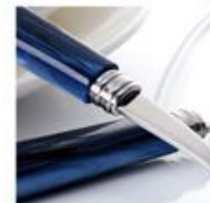
Stainless Steel Sleeve