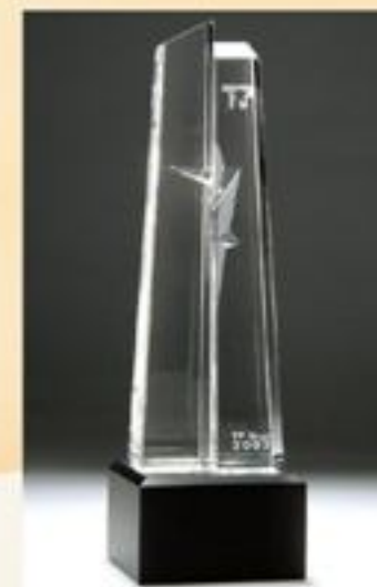
TAIWAN PACKAGING STAR 2002