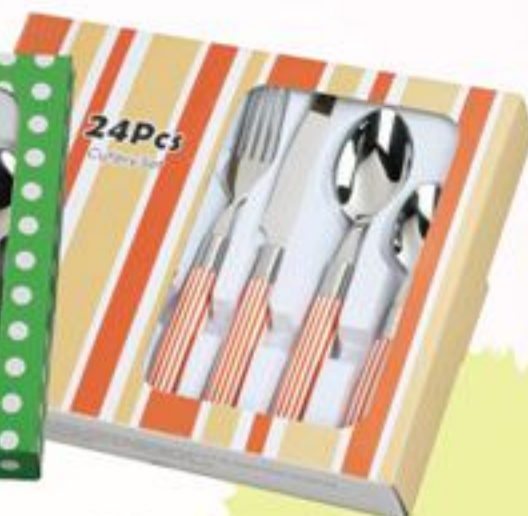
24Pcs Cutlery Set