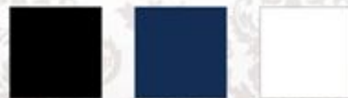
Multi-Colors for OEM