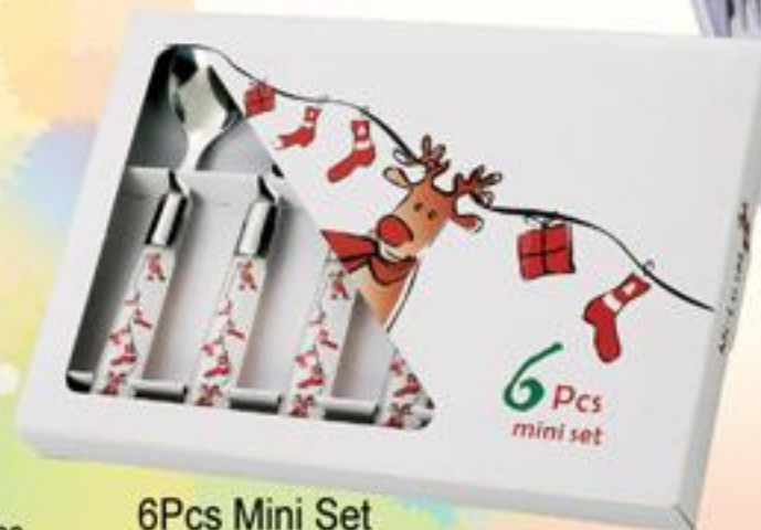
6Pcs Mini Set