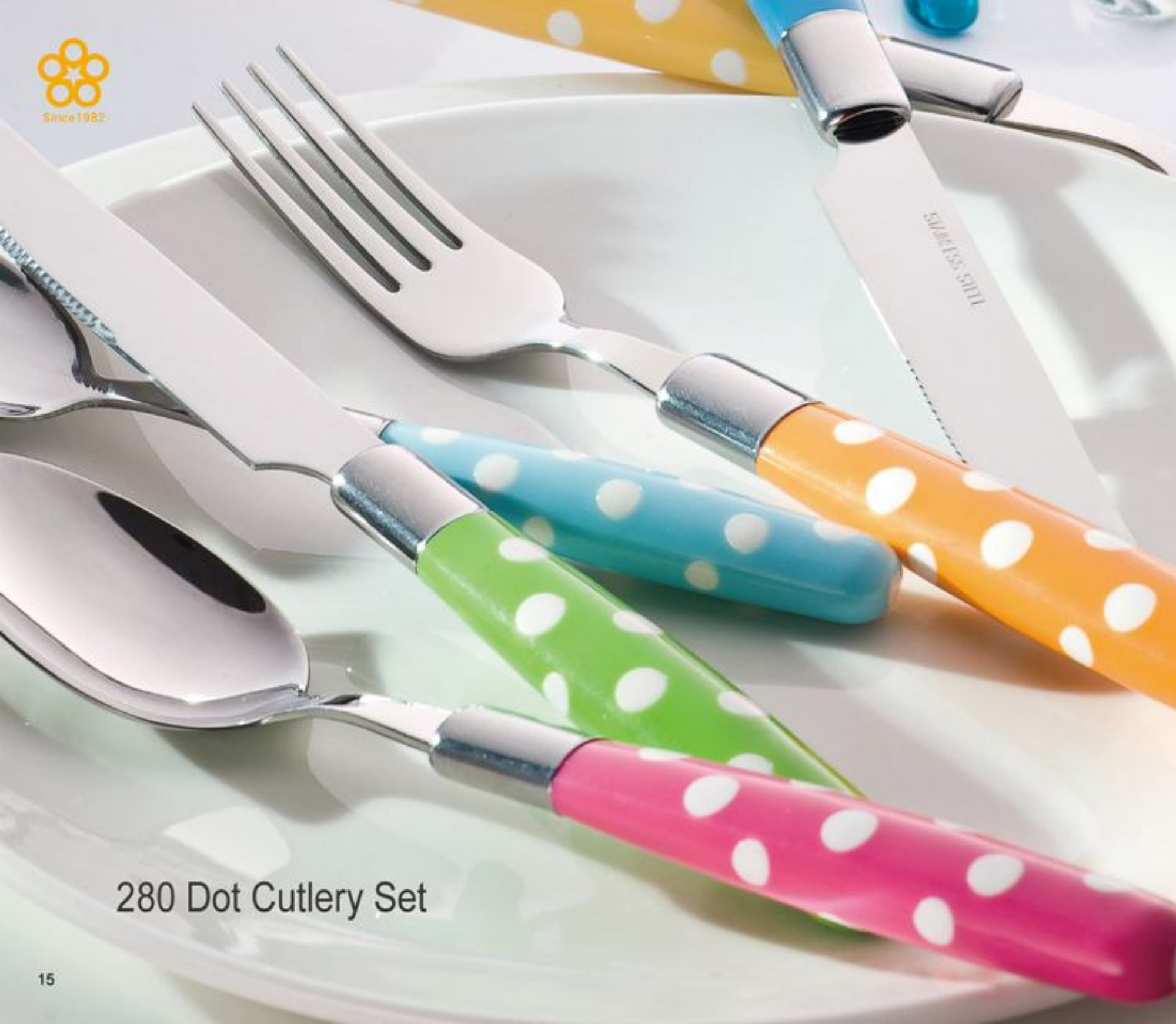
280 Dot Cutlery Set