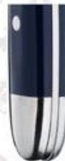
Stainless Steel Sleeve