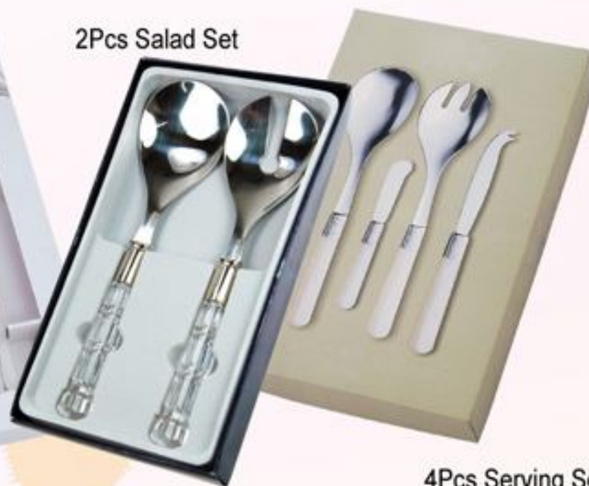
4Pcs Serving Set