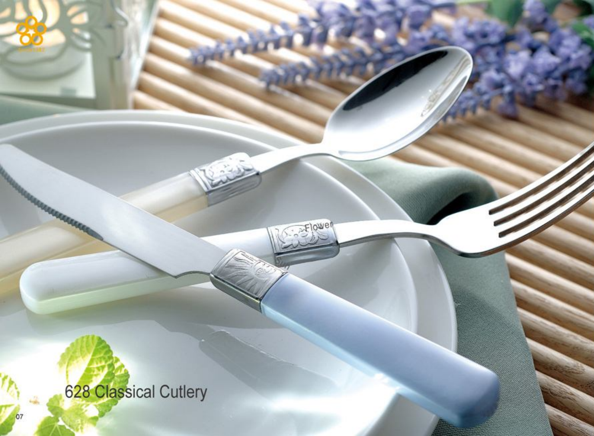
628 Classical Cutlery