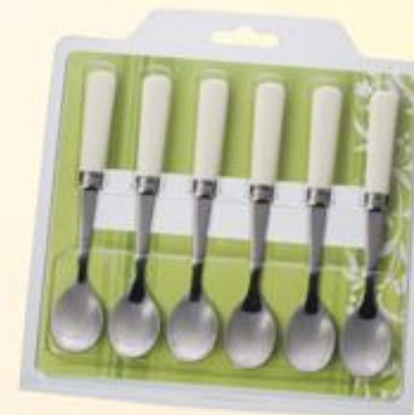
PVC / PET Series