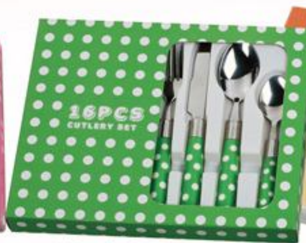
16Pcs Cutlery Set