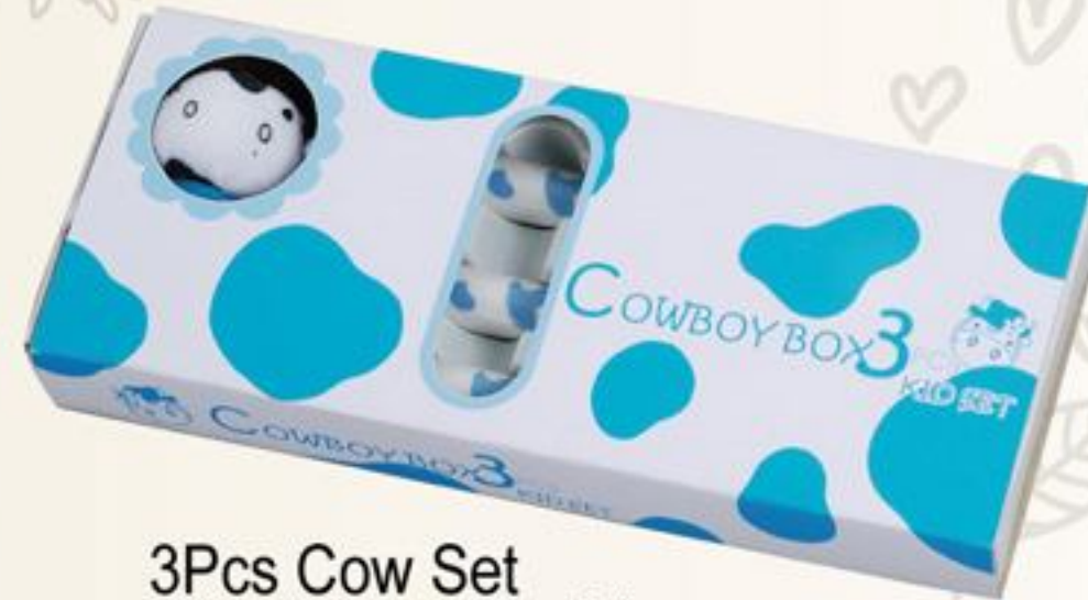
3Pcs Cow Set W/Drawer Box and Cow Dolly