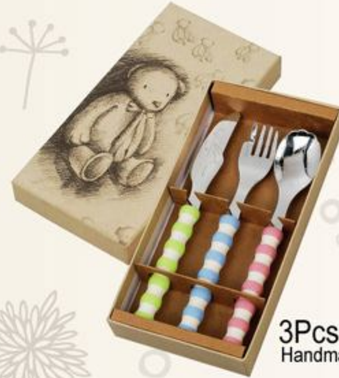
3Pcs Bear Set Handmade Box